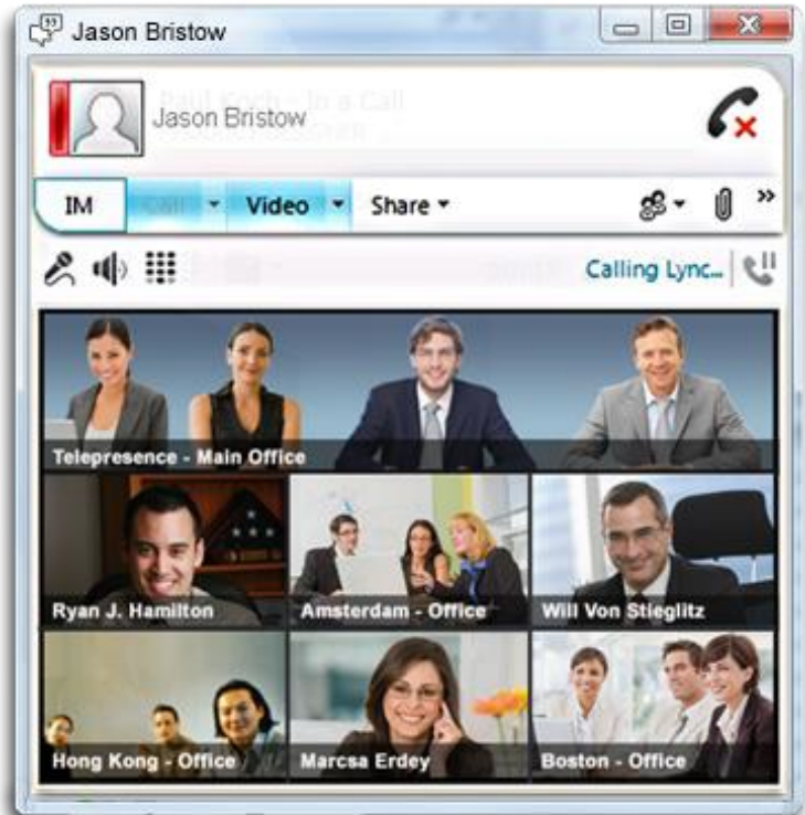
Microsoft Lync in a continuous presence multipoint call including a telepresence system

Unlike an MCU which is designed to handle multipoint conferencing connections, a gateway is based on logic specific to one-to-one connections. Gateways are measured by the number of simultaneous calls or sessions the device can support.